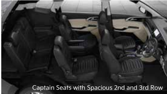
Captain Seats with Spacious 2nd and 3rd Row