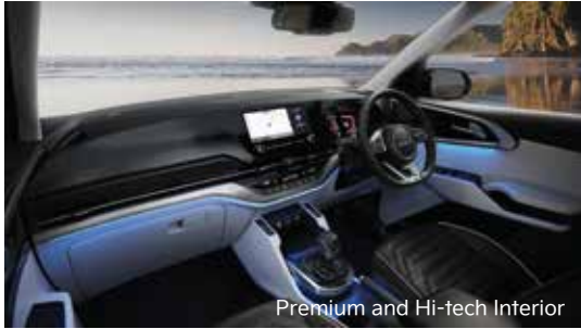
Premium and Hi-tech Interior