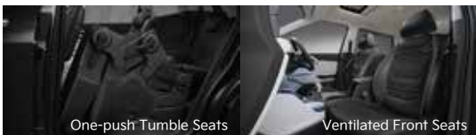
One-push Tumble Seats